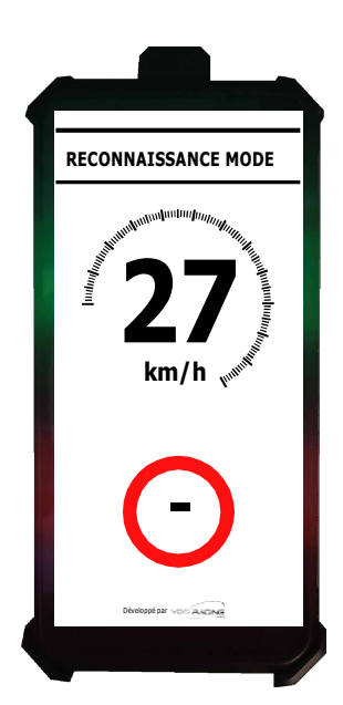
Zone with no speed limit declared by the organizer. In this case, please respect traffic regulations.